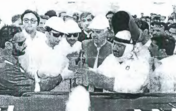
SWAT Chief Minister Khayrullah Khan inaugurating gas supply pipeline at Thel Matta of Swat district on Saturday

The total cost of the project is estimated at Rs2 billion. The project will be completed at an estimated cost of Rs2 billion and will benefit over 0.1 million residents.