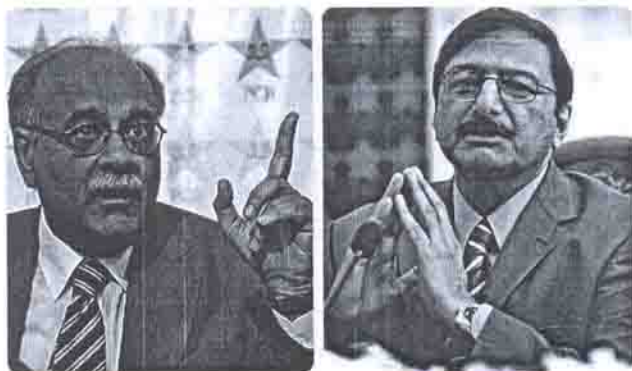
Najam Sethi and Zaka Ashraf.

ISLAMABAD: Pakistan's Supreme Court Wednesday restored Najam Sethi as the country's cricket chief, four days after he was ousted by a lower court, the latest twist in a legal saga dogging the game.