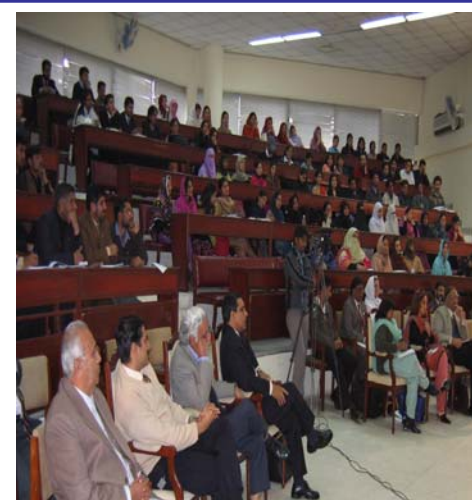
Students & Coordinators at “3 rd Youth in Governance Workshop”

He encouraged students to take part in the awareness program and appreciated Transparency International – Pakistan to organize such an event to build honest, sincere and patriotic team to save Pakistan from the dangers and malaise of corruption.