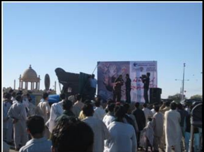
The idea behind this programme was to create awareness and involve the lay man in the fight against corruption. The program was greatly enjoyed by the public.

On Sunday, February 21, 2010 a Street Theater performance on "Corruption and its evils" took place at Jehangir Kothari Parade, Quaid-e-Azam Mazar and Empress Market.